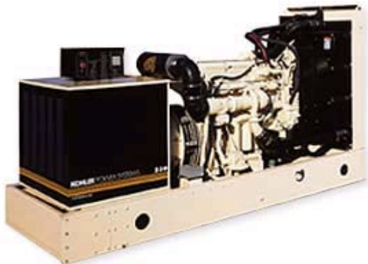
KOHLER® DECISION-MAKER™ 550CONTROLLER